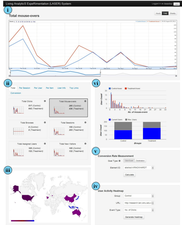
Figure 3: LASER Dashboard

Due to the implementation of the tracking code in JavaScript, one limitation of the LASER system is the requirement for users to have JavaScript enabled in their web browsers. However, this limitation has minimal impact on the effectiveness