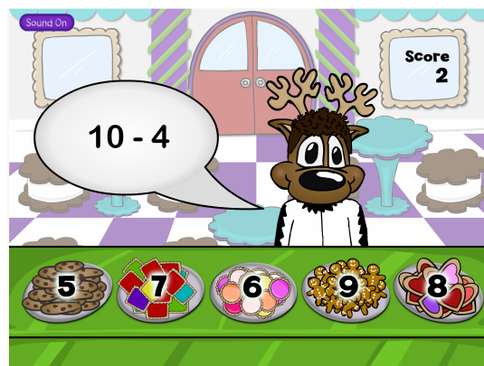
Figure 4: Sample Math Game