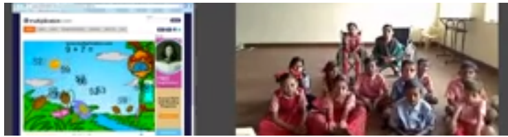
Figure 2: Screen capture of a Tutoring hangout session. At left is the screen as seen by the students and at right is the screen as seen by the tutors